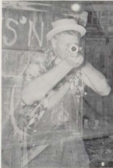
"One Gun Salute"