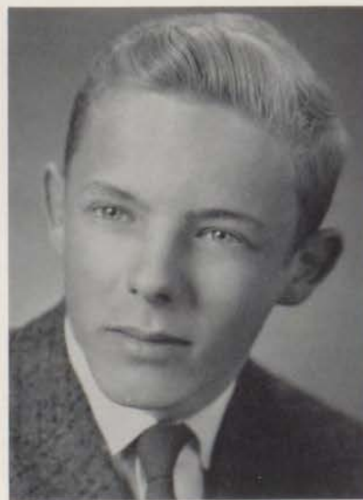
GEORGE BENNINGHOFF P. T. A. Science Award