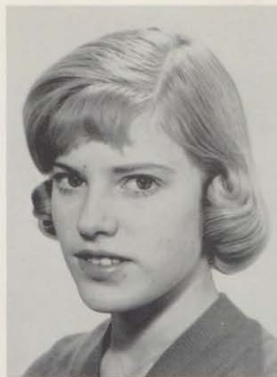
MITTEN RUBEY P. T. A. Commercial Award