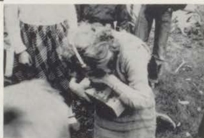
Say the pledge again, scum!