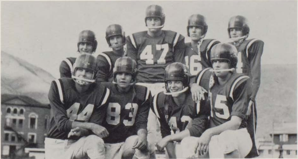
Senior Squad Members