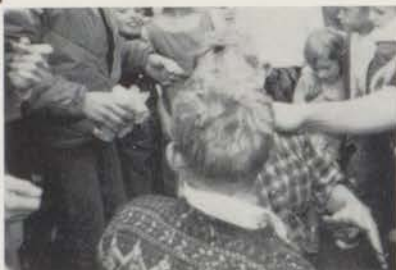
These lowly freshmen still don't know how to act.