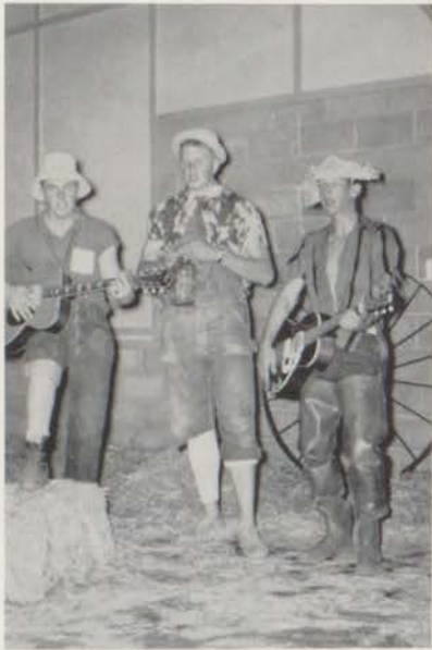
"Good ole Mountain Dew"