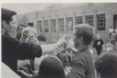
You're going to be late to class. Oh, well, getting the best of the freshmen comes first.