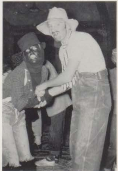
"Like Man, Integration"